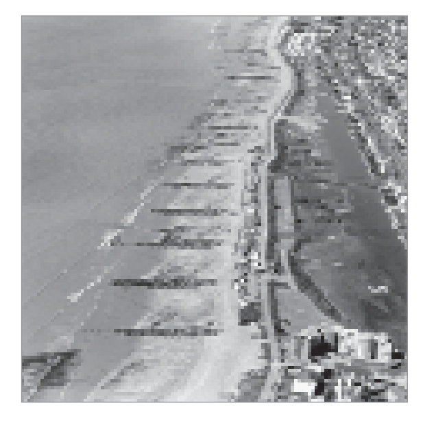
Figure 1.8 Groynes and artificial headlands

Figure 1.7 Scour protection to seawall