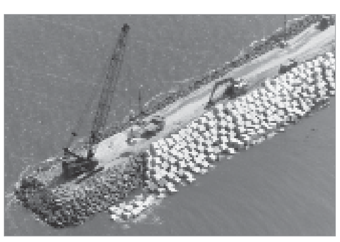
Figure 1.3 Construction of breakwater using concrete armour units