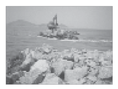
Figure 1.11 Rockfill closure dam under construction

Various types of closure works using rock are shown in the following figures. Design guidance for these structure types is given in Chapter 7.