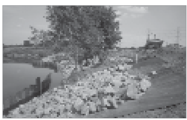
Figure 1.15 Rock revetment being constructed on geotextile

River and canal structures using rock are shown in the following figures. Design guidance for these structure types is given in Chapter 8.