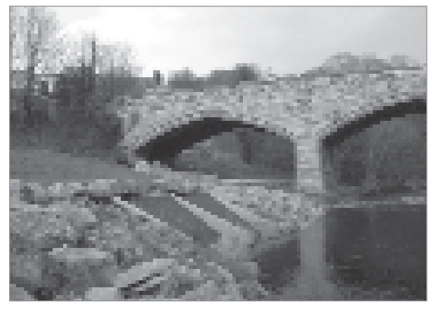
Figure 1.16 Rock protection to outfall structure on bank