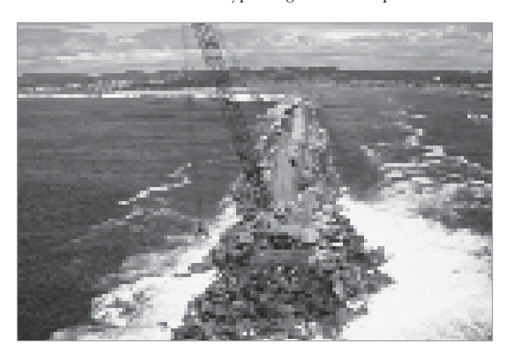
Figure 1.2 Rubble mound breakwater

Marine structures using rock are shown in the following figures. Design guidance for these structure types is given in Chapter 6.