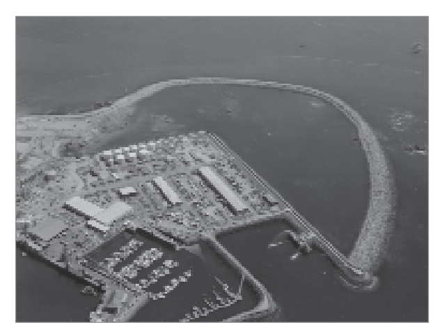
Figure 1.4 Breakwater – eventually to contain reclamation