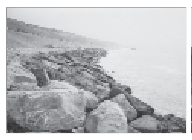
Figure 1.6Rock revetment