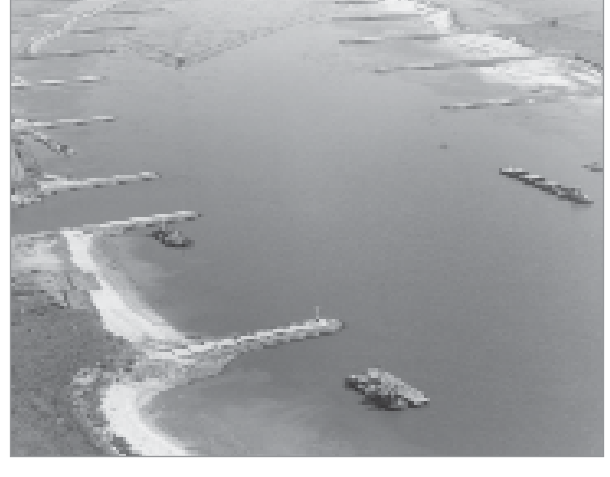
Figure 1.17 Spur-dikes (after CUR 1995)