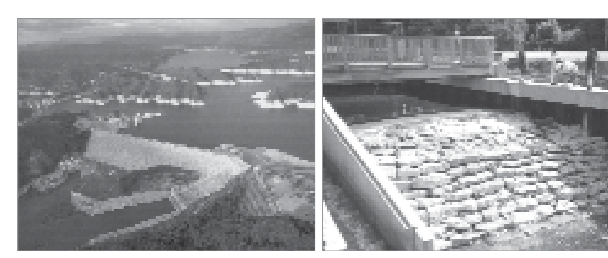
Figure 1.13 Reservoir dam