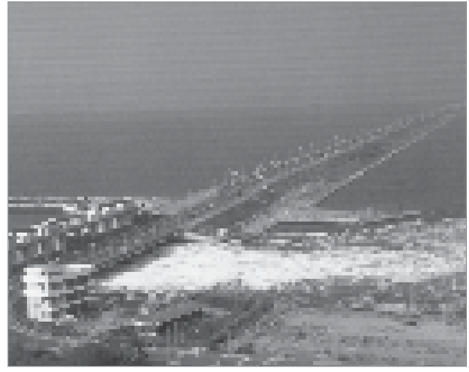
Figure 1.12 Sea dike