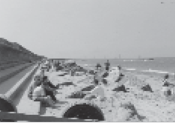
Figure 1.7 Scour protection to seawall