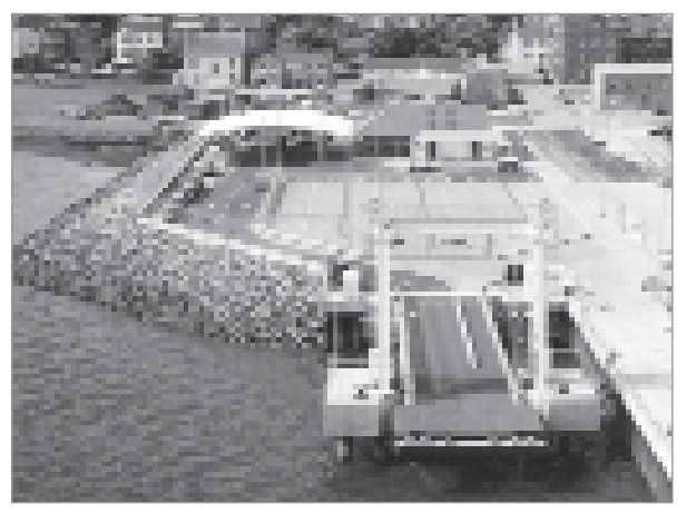
Figure 1.5 Rock protection to port structures